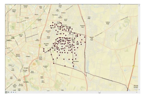
B. Reallocation of waste bins in study area

A. Base map of waste bin present in study area